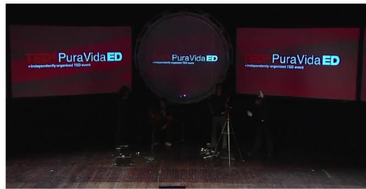
Figure 3. Performance of ElectrizarArte in TEDx PuraVidaED.