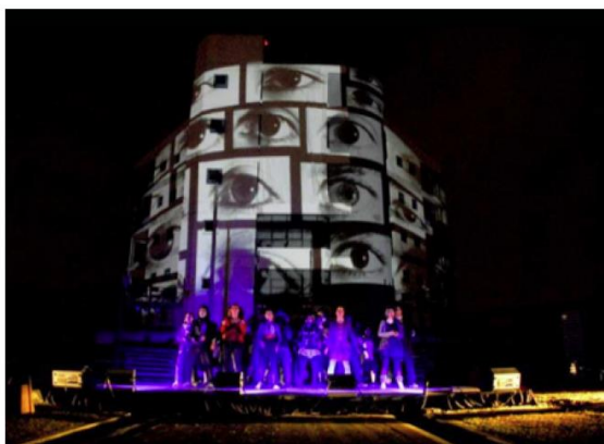
Figure 2. Performance of ElectrizarArte in ExpoUCR 2011

Some projects developed by the ElectrizarArte students during the first stage are: two LED cubes, a Tesla Coil, a laser-based harp (Lumint, laser for musical interface), a body gesture-based synthesizer, a vibration-sensible lighting set for percussion and building sized VU-meter. Most of these projects have been presented in several musical performances prepared by the students themselves. The ElectrizarArte presentations include a campus-wide open house event (Expo UCR, see Figure 2), a TEDx event (see Figure 3) and visits to campuses of three different universities (see Figure 4).