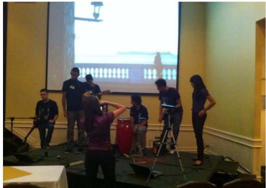
Figure 4. Performance of ElectrizarArte in other campuses

In the second stage, the work has included updates to the existing projects (like support for sound synthesis using the Tesla Coil) and some new projects, like a tone matrix. The presentations have included in-houses performances, as well as regional events and tours to other campuses of the university.